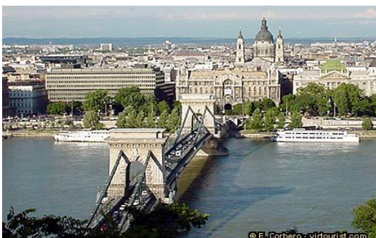
Chain Bridge and the Pest side of the Danube

You will be trained with special tools and a Bible-based curriculum to teach English / German as a foreign language. You will have your own story translated to use as a way to introduce yourself and communicate your faith. Church members will be there to help as well. In Hungary, you will be provided Hungarian Bibles to distribute to your students.